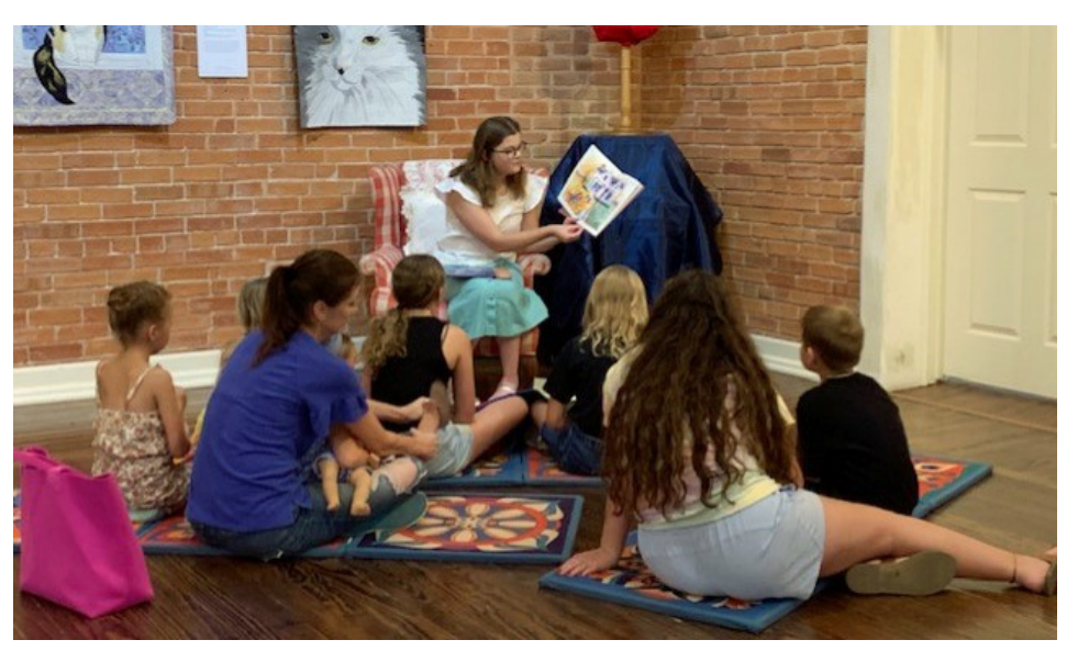
Reading aloud for Story Time Saturdays.

Did you miss out on something at Festival Booth that you liked? Just let us know...many of our crowd favorites sold-out fast but are now available in-store and online!