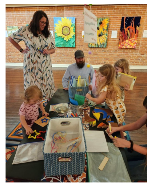
Fun in The Kids' Zone.

So, let us be your "one-stop shop" for unique gift items this season...we'll wrap it and ship it straight to your door, or theirs!