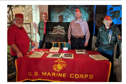
Museumgoers were able to "Thank a Veteran" for their service.