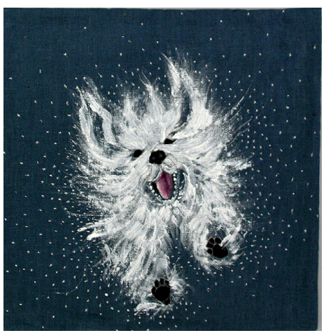
Glee (24" x 24") by Holly Cole