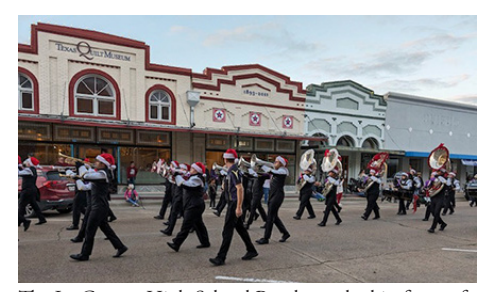
The La Grange High School Band marched in front of the Museum.