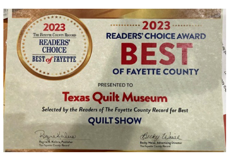
TQM Received the Readers' Choice Award from The Fayette County Record for Best Quilt Show in Fayette County.

Speaking of those folks...our lovely Volunteer docents are area quilters who come to us mainly through the Colorado Valley Quilt Guild. The Texas Quilt Museum thrives on how they graciously lend their wisdom and expertise in answering the many quilt questions and help our visitors to truly enjoy the "TQM Experience."