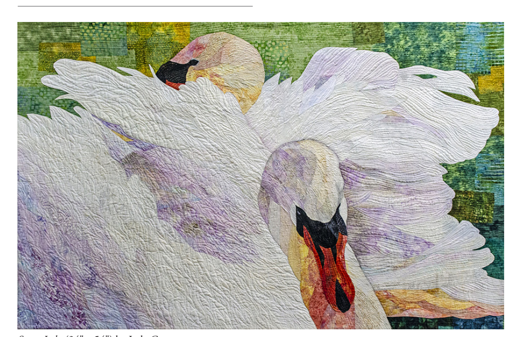
Swan Lake (34" x 54") by Judy Crotts