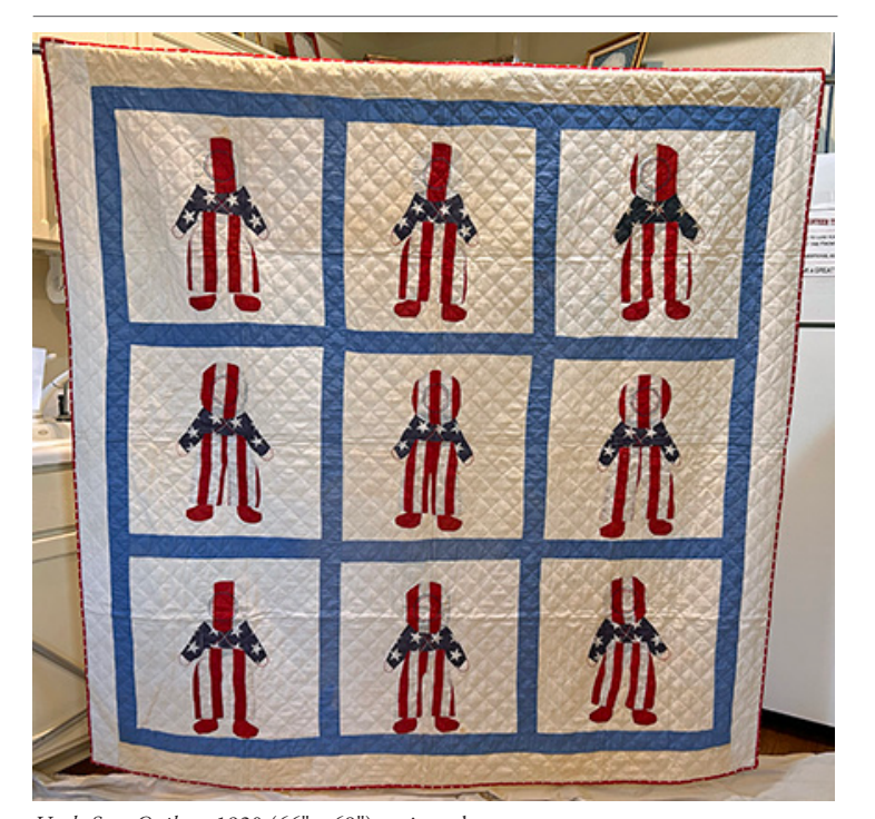
Uncle Sam Quilt, c. 1920 (66" x 68"), artist unknown