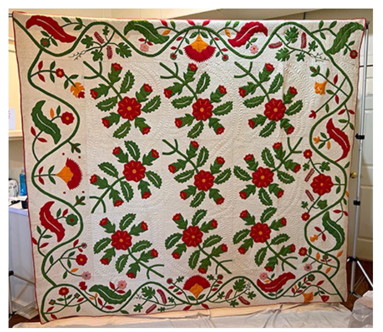
1860 Floral Appliquè Quilt (88" x 88"), artist unknown