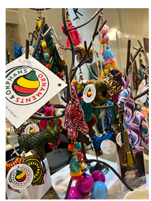
Ornaments 4 Orphans

So come see us and do your holiday shopping here in downtown La Grange! We will be happy to see you and happy to have you support our talented artists with their quilts on the walls or their work on our store shelves. It's been a good year, and we look forward to seeing you!