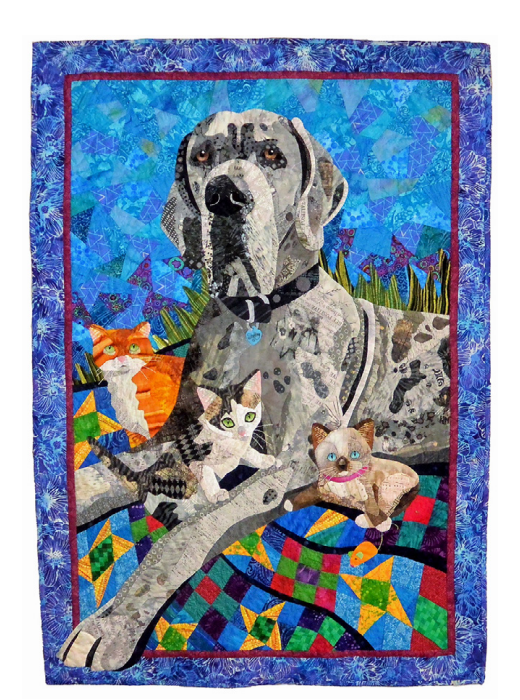
Auntie Shelby (40" x 28") by Nancy S. Brown

Creatures surround us, enfold us, cheer us up, protect us, and delight us. The call was open to both art quilts and traditional quilts expressing the many creatures of our daily lives.